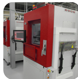
4 to 12 Cells Climatic Chamber