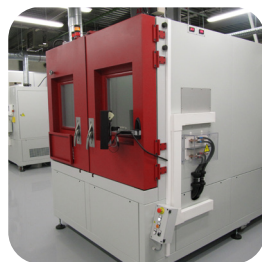
King Size pack