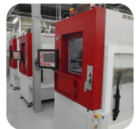
4 Climatic Chambers